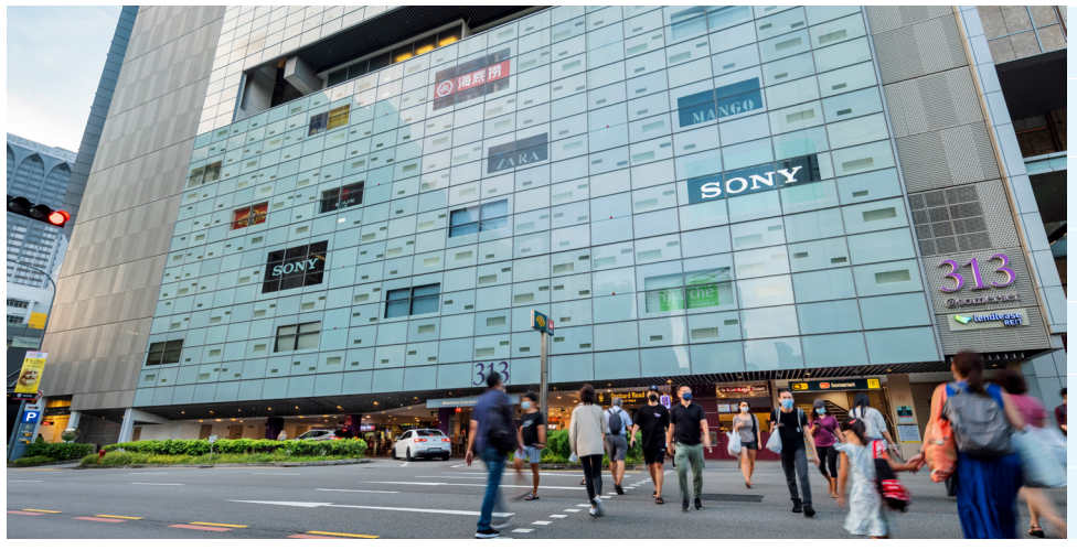
Туре Prime Retail 99-year Leasehold Title<sup>12</sup> (from 2006) Valuation Cap Rate<sup>11,13</sup> 4.25% NLA (sq ft) 288,946 Appraised Value<sup>11,14</sup> S$1,046.3 million % Portfolio 28.41% (By Appraised Value) Year of Completion 2009